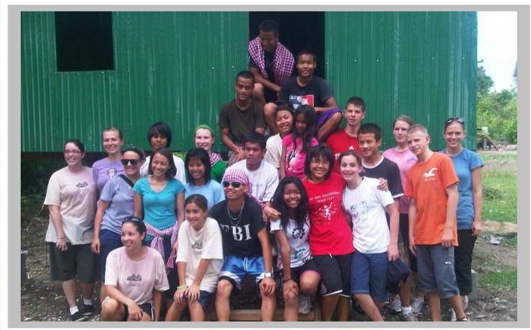
Canada House Kids in Kandaue village, Koh Kong province, Cambodia.

Have you ever wanted to do more? To contribute in a hands-on way to Tabitha? Volunteer! Organize your own group or join a house building team from around the world. Contact us to join a build team now!